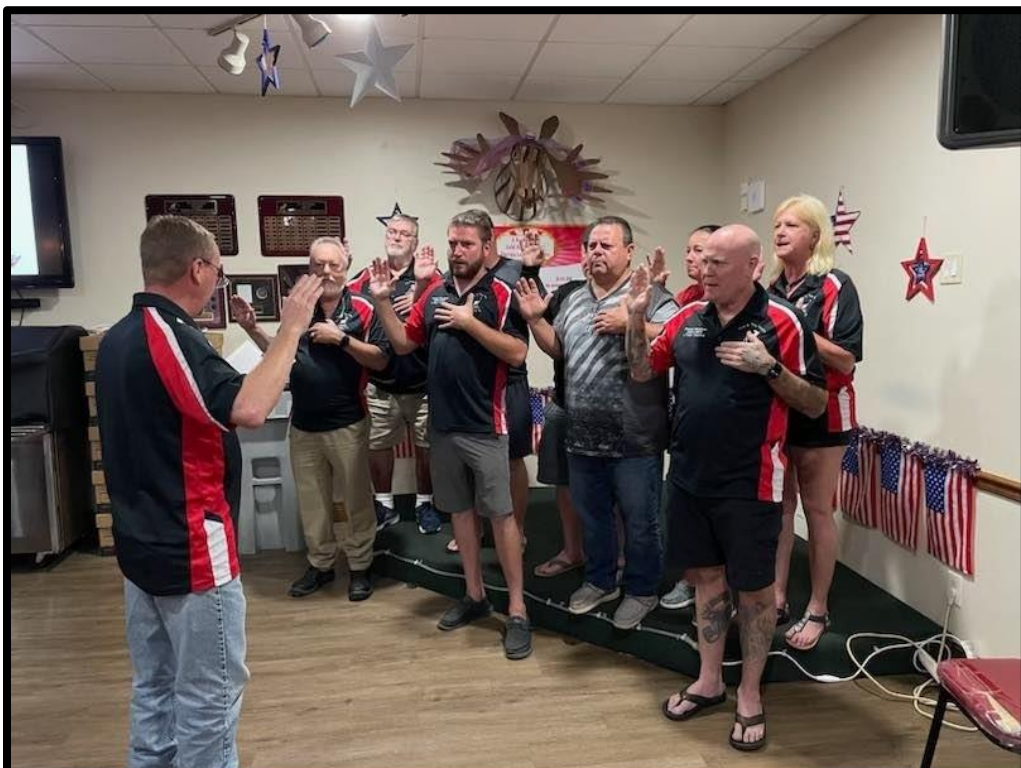
Swearing in of Your new Board of Officers. This Board will start May 1st. 2023 through 2024. Looking forward to working with them!